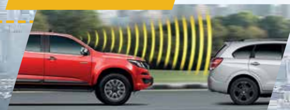
Forward Collision Alert