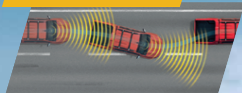
Lane Departure Warning