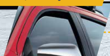
Comfort Closing Windows