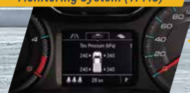
Tire Pressure Monitoring System (TPMS)